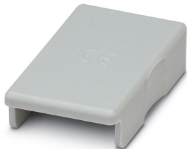
Protective end covers for TMC 8 bus bars

Please be informed that the data shown in this PDF Document is generated from our Online Catalog. Please find the complete data in the user's documentation. Our General Terms of Use for Downloads are valid ( http://phoenixcontact.com/download )